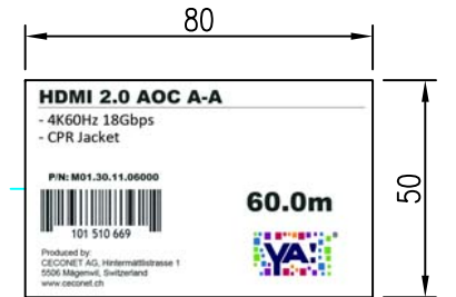
Label for inner box and outer carton MODIFY