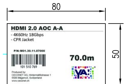
Label for inner box and outer carton