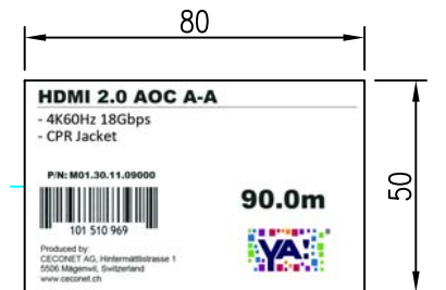
Label for inner box and outer carton