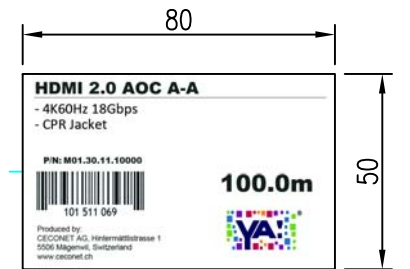
Label for inner box and outer carton