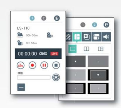
Mini Controller from Mobile Device