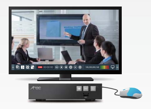
On-screen GUI & USB Interface*

AREC Online Director supports a wide range of control options, including Web Browser (IE, Firefox), Software Application (Windows, Mac OS), Touch-Friendly Graphical User Interface, and Mini Controller from Mobile Device. Control buttons on the front of LS-110 are also provided for easy operation.